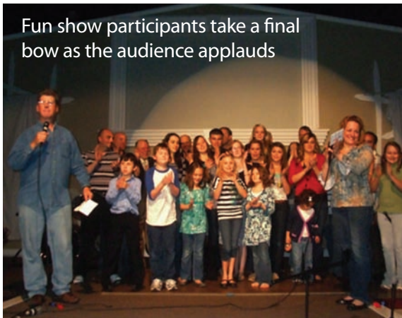
Fun show participants take a final bow as the audience applauds