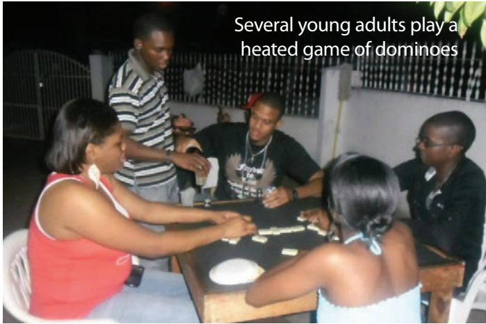
Several young adults play a heated game of dominoes