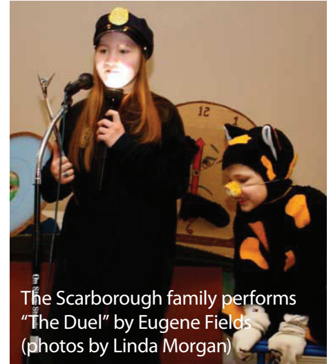
The Scarborough family performs "The Duel" by Eugene Fields