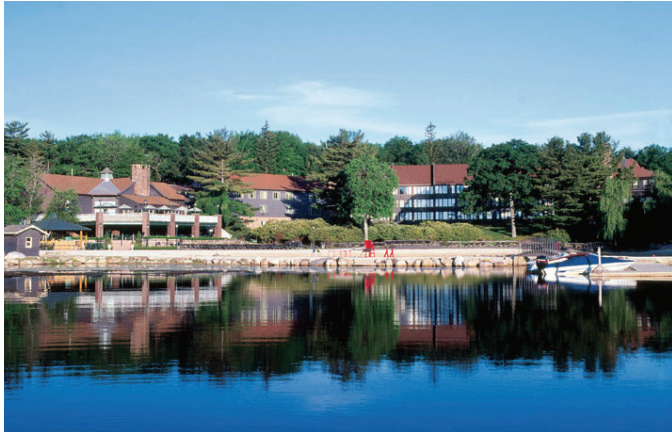
Split Rock Resort, Lake Harmony ( www.splitrockresort.com ), page 4