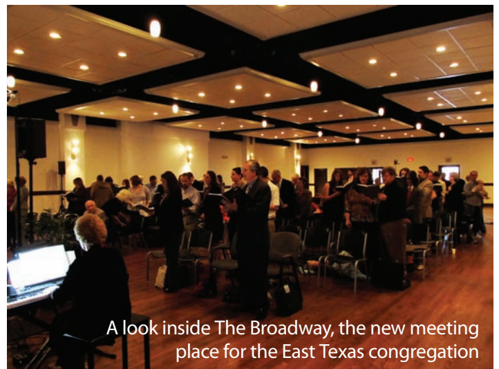
A look inside The Broadway, the new meeting place for the East Texas congregation