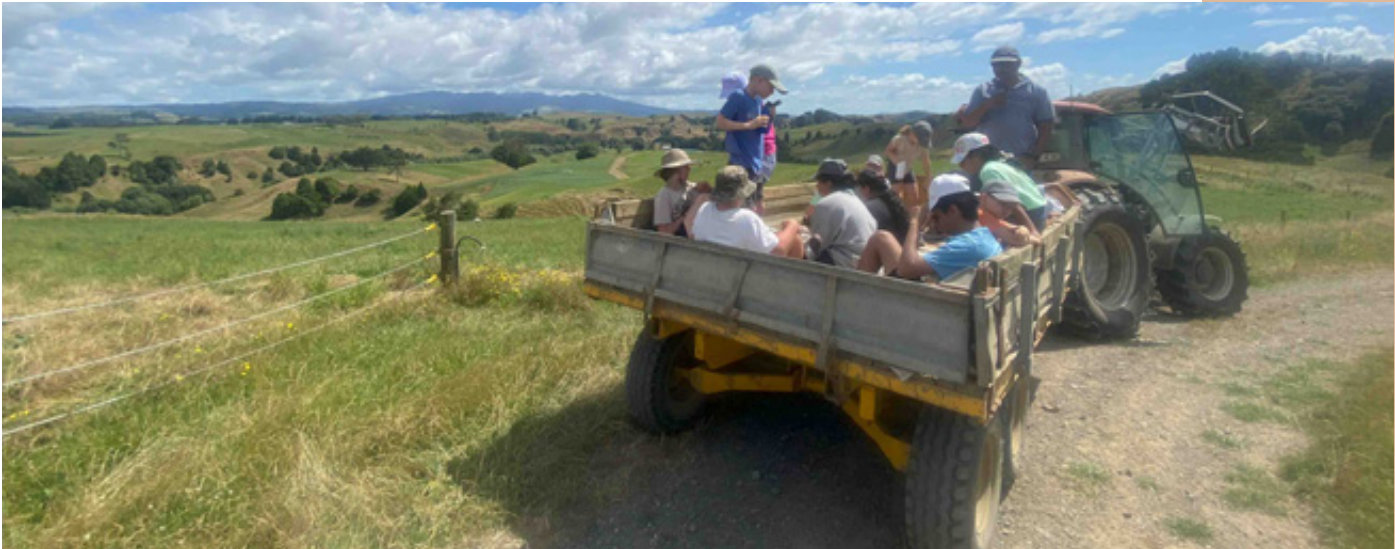
Auckland Camp Weekend New Zealand