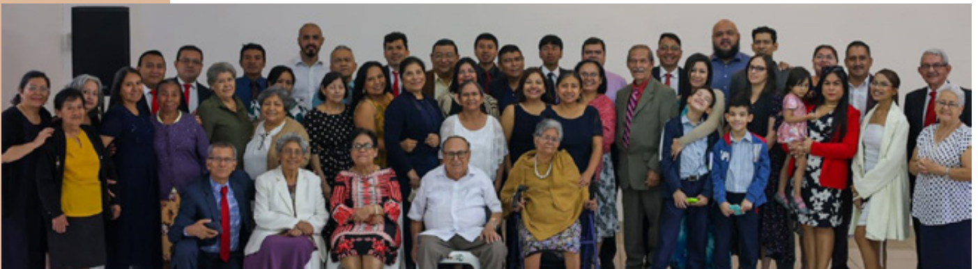
San Salvador Congregation El Salvador