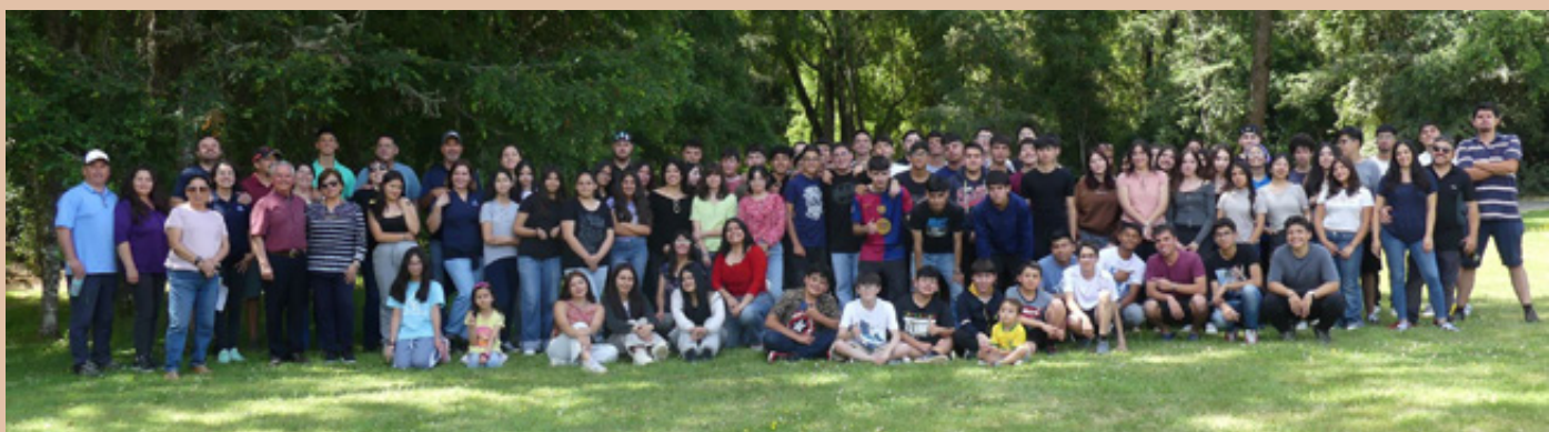
COGWA Youth Camp Chile