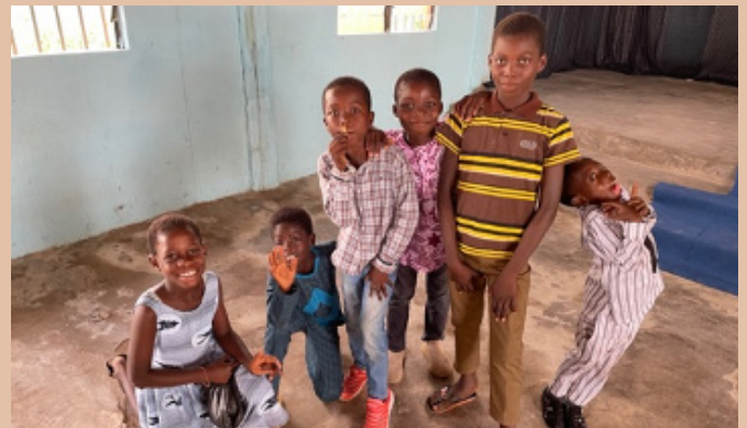
Church Children Yeji, Ghana