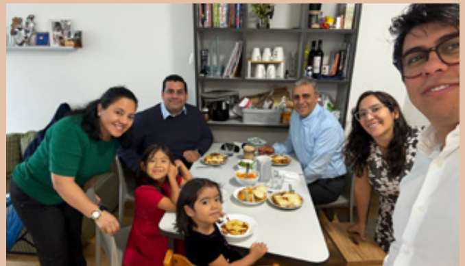
Spanish-Speaking Brethren Europe