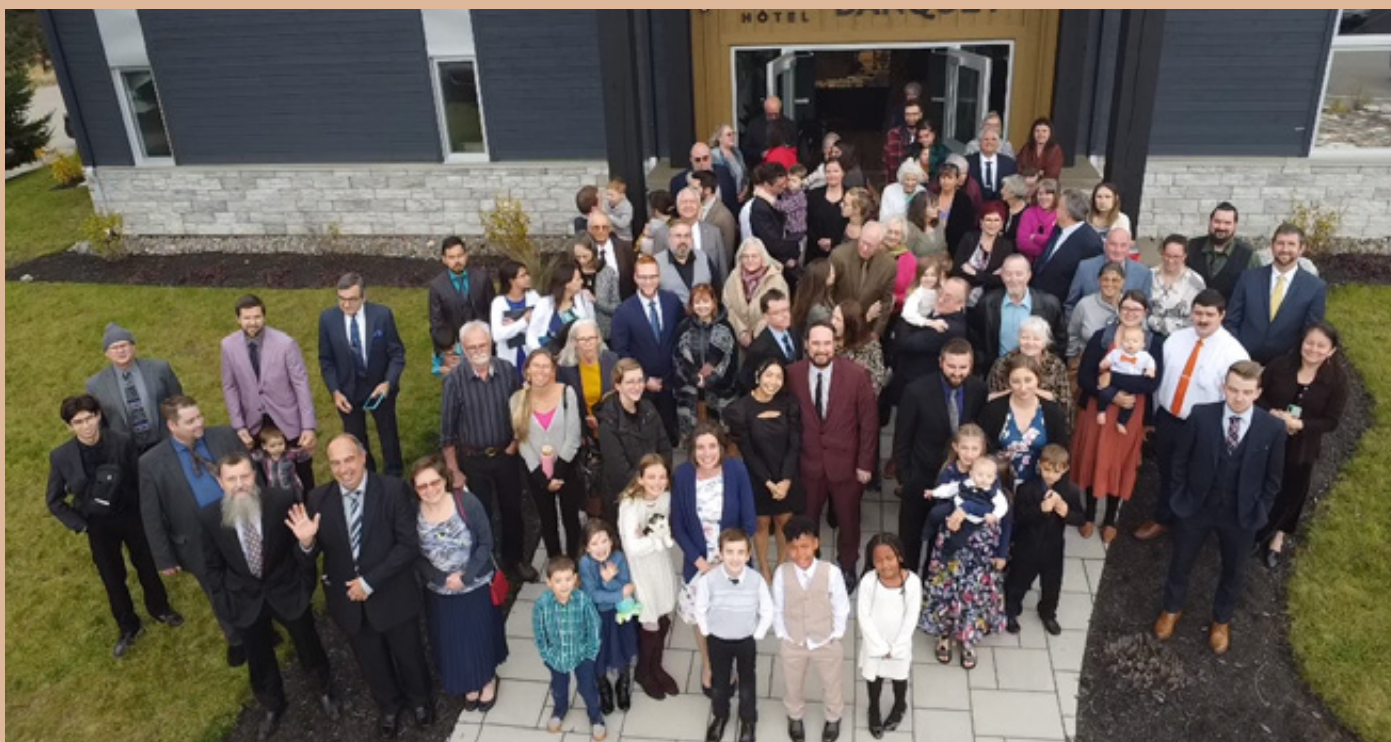
Feast of Tabernacles 2024 Mont-Tremblant, Québec