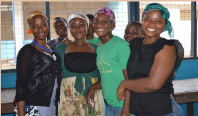
COGWA Youth Camp Kitchen Staff Ghana