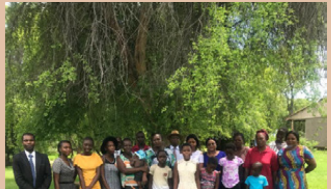
Kariba Congregation Zimbabwe