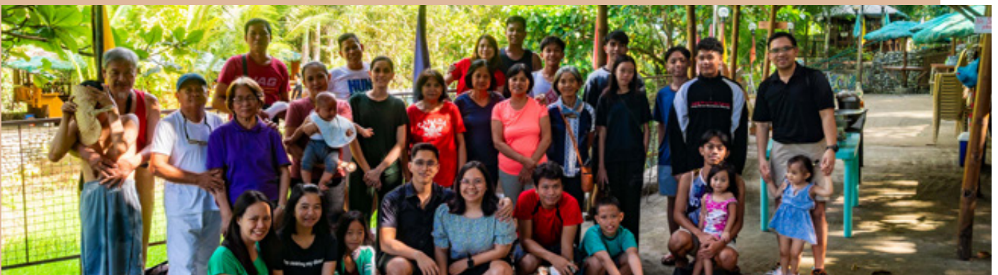
Congregation Outing Philippines