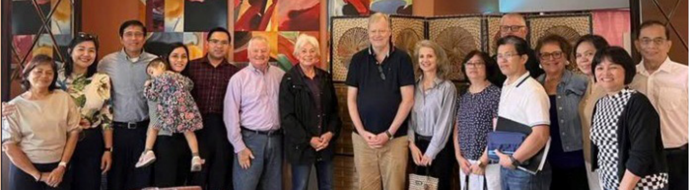
Pastoral Development Program 2024 Philippines