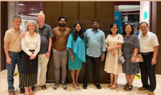
Night to Be Much Observed 2024 Batam, Indonesia