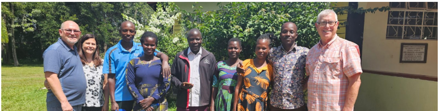
International Leadership Program, January 2025 Migori, Kenya