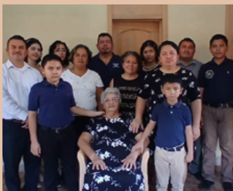
El Estor Congregation Guatemala