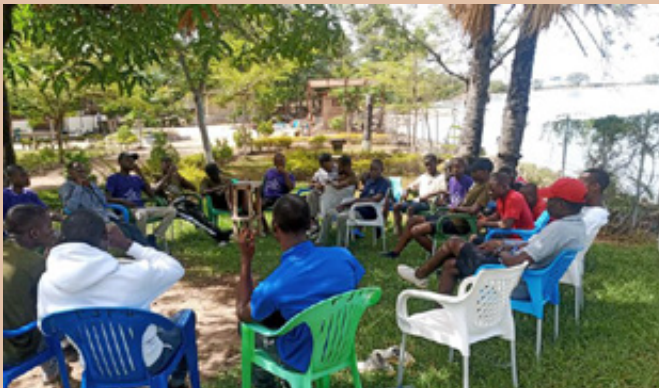
COGWA Youth Camp Malawi