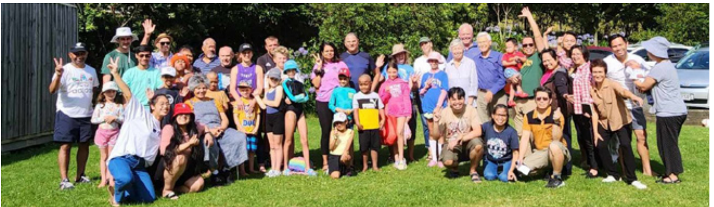
Young Adult Retreat New Zealand