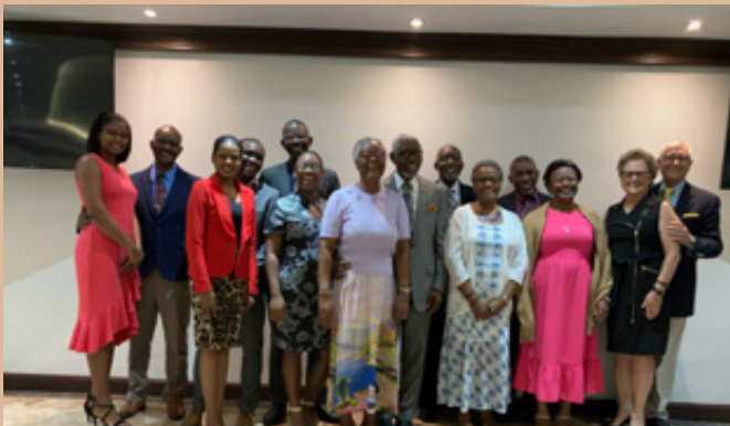
International Leadership Program 2024 Jamaica