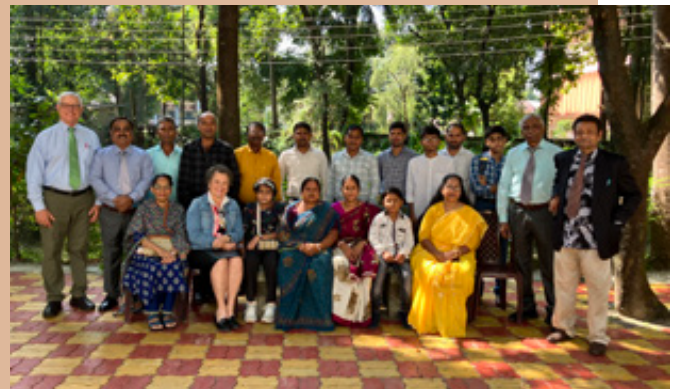
Feast of Tabernacles 2024 India