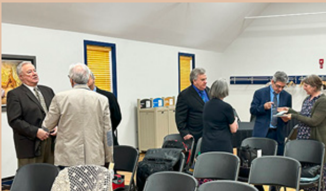
Montreal Congregation Canada