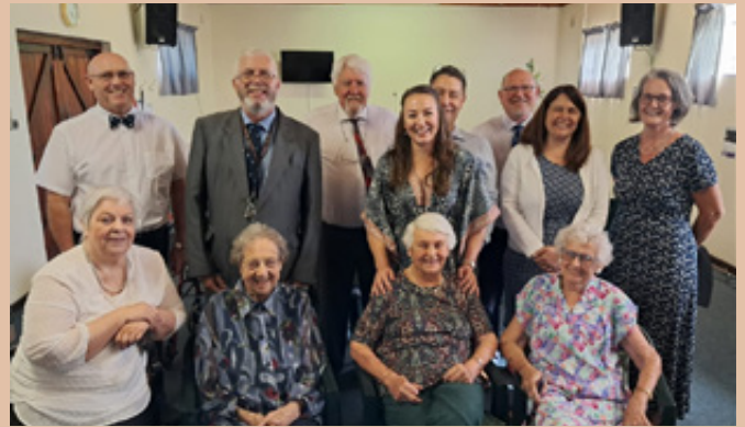
Cape Town Congregation South Africa