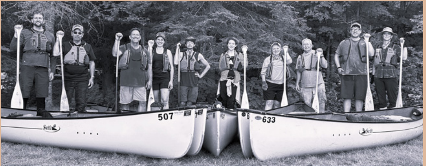
Young Adult Canoe Trip Ontario