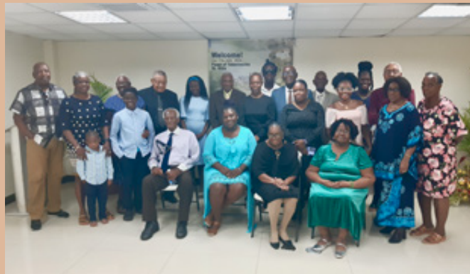
Feast of Tabernacles 2024 St. Kitts