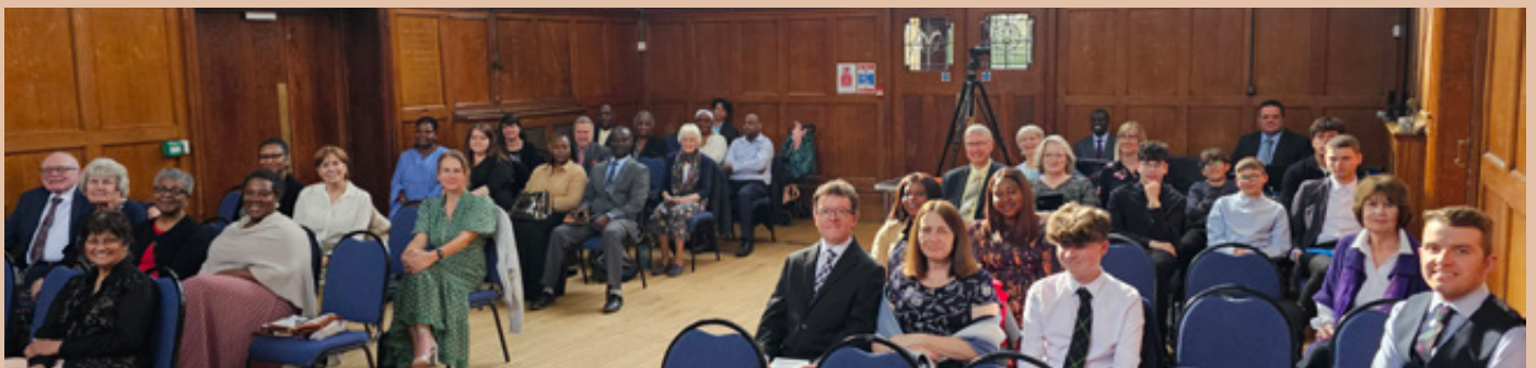
Combined Sabbath Service England