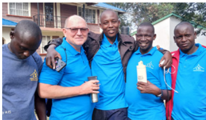
COGWA Youth Camp Staff Kenya