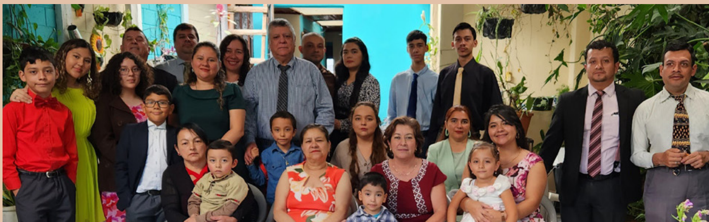
Young Adult Camp Guatemala