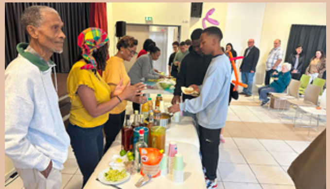
Feast of Tabernacles 2024 Montagnac, France