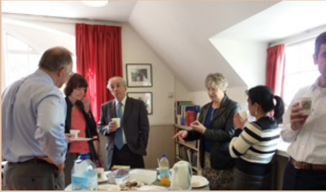
London Fellowship England