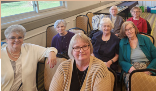
Calgary Congregation Alberta