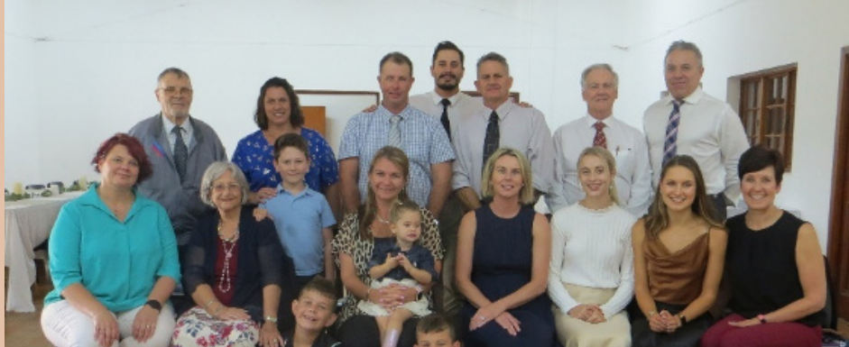
Eastern Cape Congregation South Africa