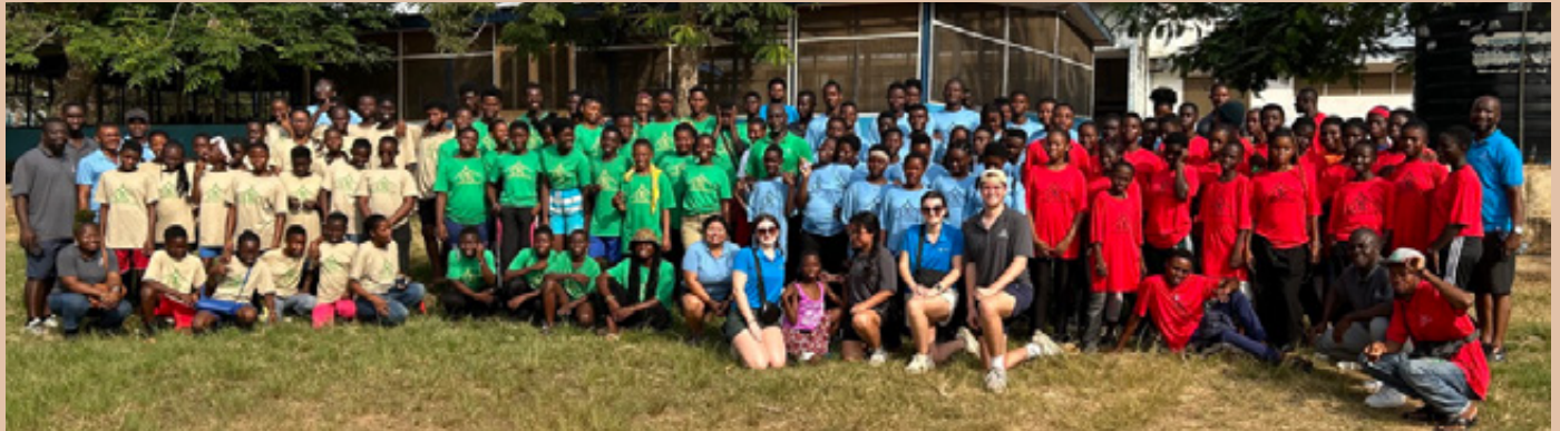
COGWA Youth Camp 2024 Ghana