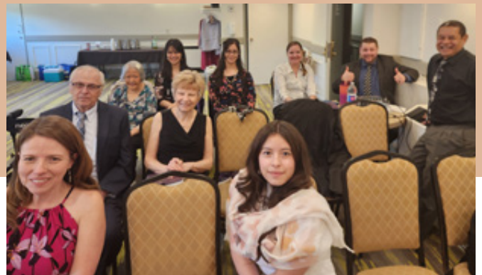
Calgary Congregation Alberta