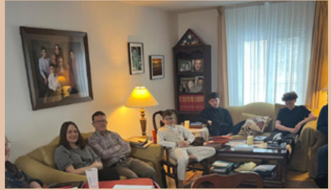
Visiting Members in Prague Czech Republic