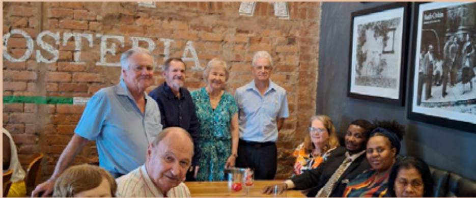
Senior Luncheon Durban, South Africa