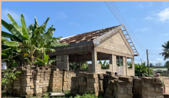
Church Building Winneba, Ghana