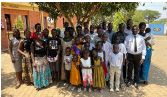
Kitgum Congregation Uganda