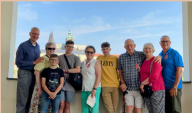
Prague Brethren Czech Republic