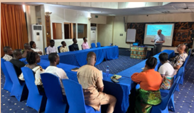
International Leadership Program Elmina, Ghana