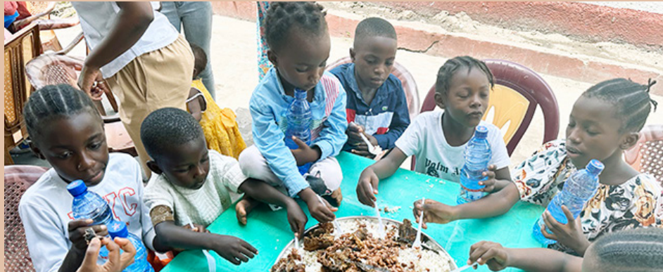
Children Sharing a Meal DR Congo