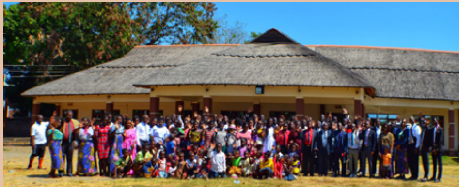
Feast of Tabernacles 2024 Malawi