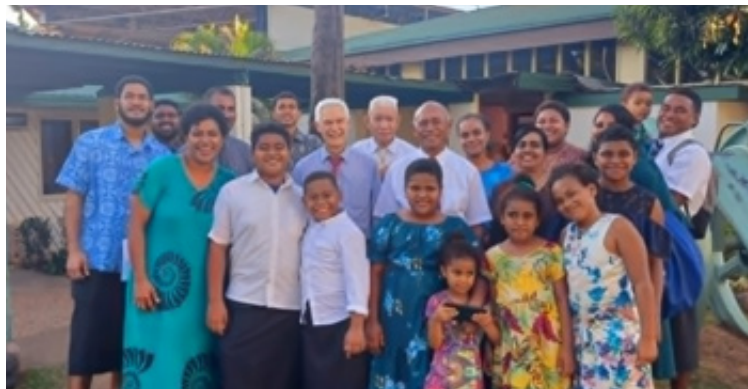
Nadi and Suva Congregation Fiji