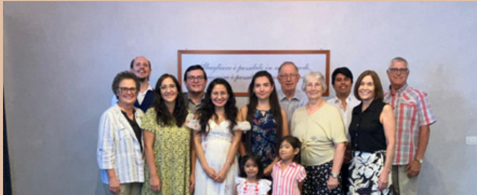
European Brethren Maastricht, Netherlands