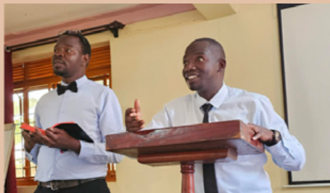
Kitgum Sabbath Services Uganda