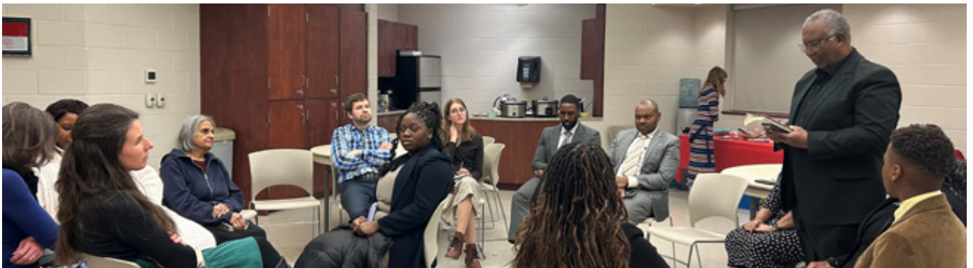
Toronto Leadership Club Ontario