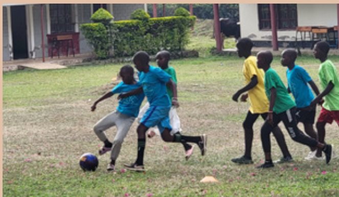
COGWA Youth Camp Kenya