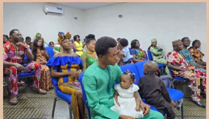
Lagos Congregation Nigeria