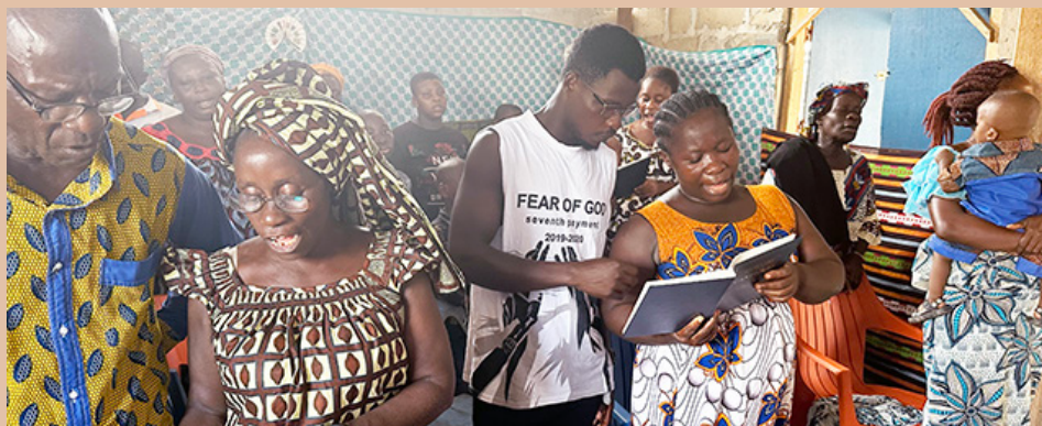
La Mé Congregation Côte d'Ivoire