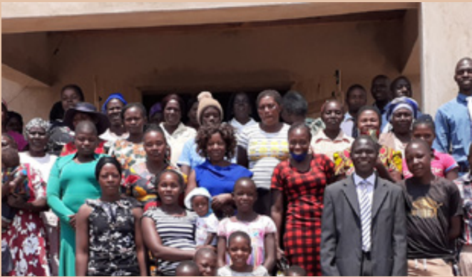
Chemba and Mbungu Brethren Gokwe, Zimbabwe