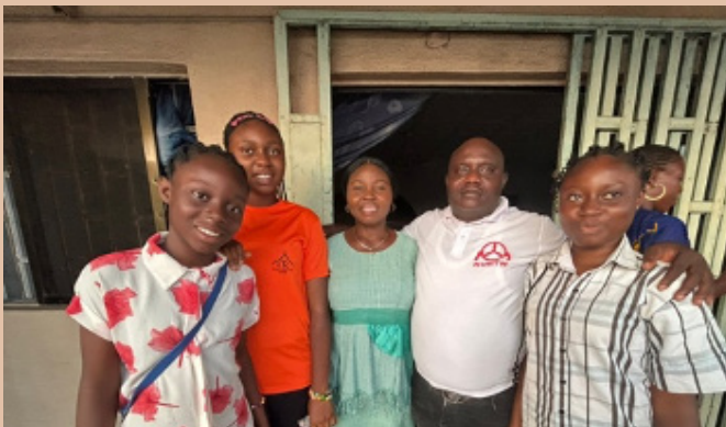
Benin City Brethren Nigeria