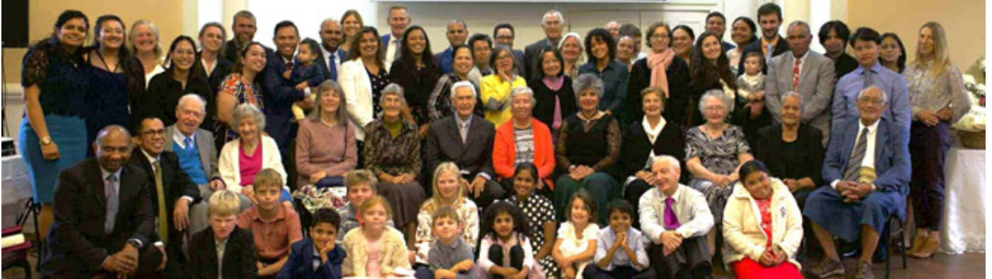
Auckland Congregation New Zealand