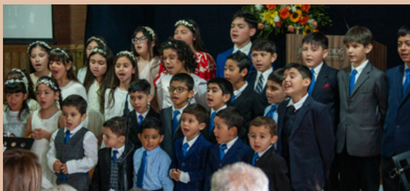
Children's Choir Temuco, Chile