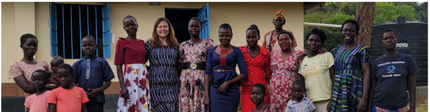
Ochuna Congregation Kenya